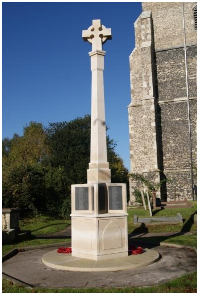
Holy Trinity War Memorial, Milton Regis