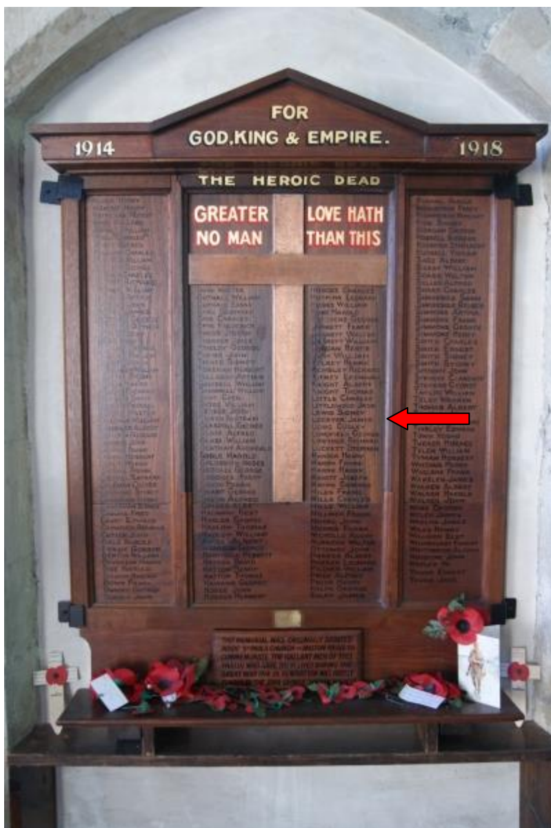
St. Paul's Church Roll of Honour, Milton Regis now located in Holy Trinity Church