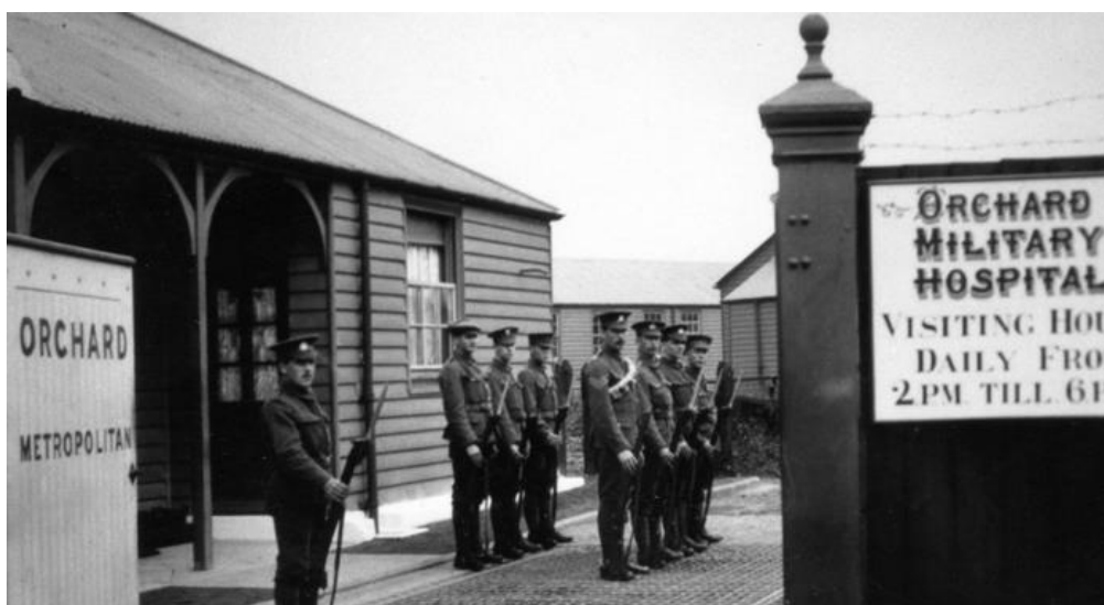
The Orchard Hospital, built in 1901/2, was turned over to the military during World War 1 & became the 3rd Australian Auxiliary Hospital, Dartford