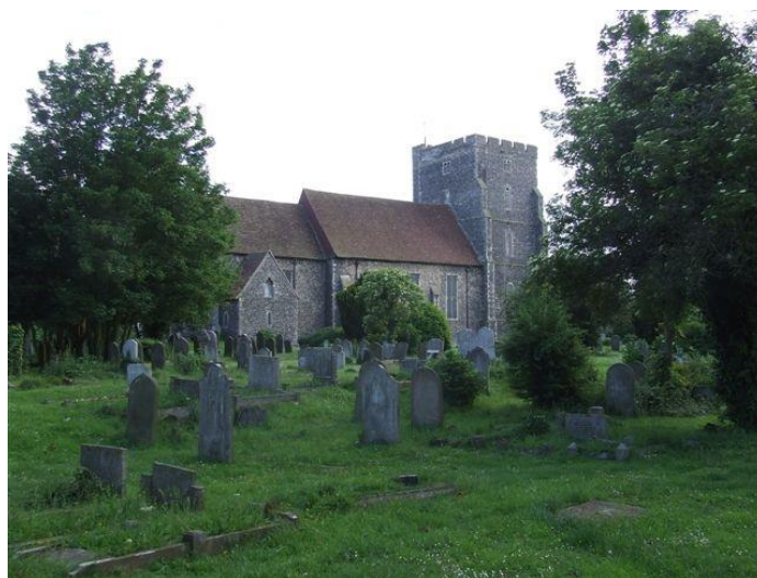
Holy Trinity Churchyard, Milton Regis

Holy Trinity Churchyard, Milton Regis, Kent contains 9 Commonwealth War Graves – 7 relate to World War 1 & 2 from World War 2.